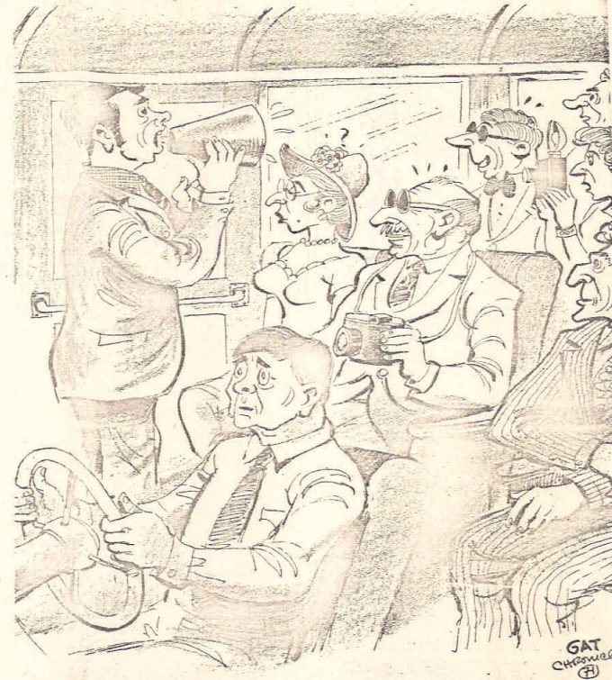
A GUIDED TOUR

In the urban areas, he lives like a veritable animal in shanties the misery of which is further enlarged